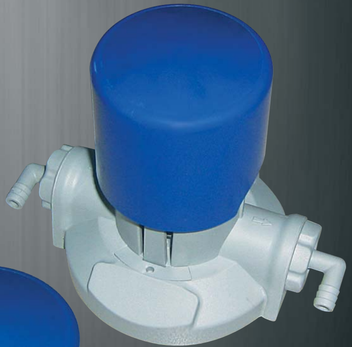
▲ Standard model