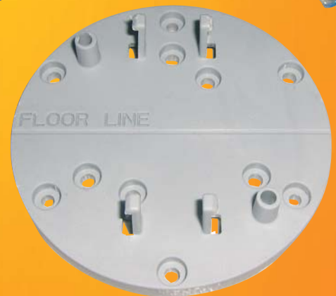
▲ wall mounting bracket