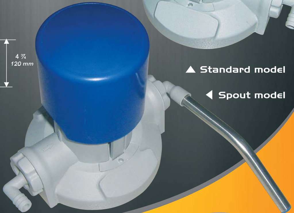
◀ Spout model